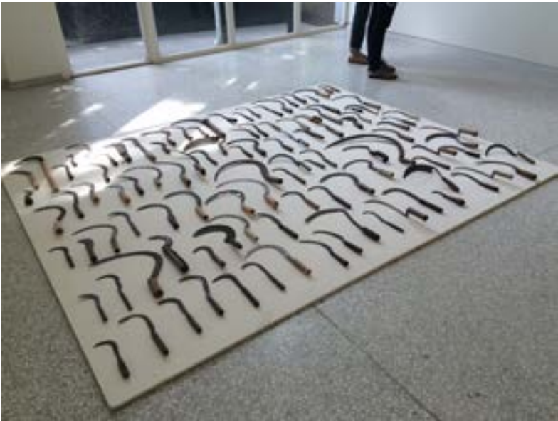
Figure 3. herman de vries, sickles from to be all ways to be , Venice Biennale, 2015.

Armpit presents an exclusively male world and yet even masculinity is laid bare as a subject formation in its obsolescence. The garage men combine a historical form of artisanship, with an equally long history of manual labor to make a new formation — a tinkerer who appropriates architectural structures in their demise and uses them for nonproductive labor. The wood fragments that make the scaffolding of the pavilion hark on the Latvian woodshed, and thereby suture the figure of the garageman with the tradition of artistic training in Latvia by which students would take over woodsheds as studios to train in plein air painting. Thus, the woodshed space sutures together the men's nonproductive manual work and the aesthetic sensibility for archaic spaces and tool-working.